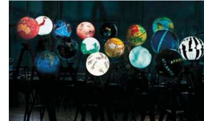
The Worldprocessor Studio in Tribeca, New York City 1999

1957 生於德國，貝文新 1977 海峽克福，歌德大學，民族與文化人類學系 1983 德國，杜賽道夫，藝術學院，藝術碩士 1983 紐約 P.S. One 獎學金 1984 DAAD 獎學金美、德兩國獎學金基金會授予 1984-1987 ABC 新聞網，CBS 新聞網，歐洲電視台新聞，自由約聘記者 1985 德國布爾斯威克造型藝術大學，邀請演講 1986 奧地利，林茲，電子藝術中心，邀請演講 1987 德國明斯特藝術設計學院，客座演講 1987 德國國家藝術基金，研究補助 舊金山藝術機構，駐村藝術家 國際新聞網，顧問 1987-1990 德國 taz, Chancen (日報、月刊) 駐聯合國正式特派員 1989 籌辦東歐第一家非營利電視台 (X 頻道 萊比錫，東德 (前)) 1990 瑞典，斯德哥爾摩，未來學研究所，邀請演講 東南亞訪問旅遊，報導難民、再移民、亞洲內部移民活動、難民營 1990-1994 德國，科隆，媒體藝術學院，媒體藝術研究 1991 《東歐獨立電子媒體調查》與紐約國際新聞網 Evelyn Messenger 共同發表 (1992 年出版) 研究報告 出版《地球 66 個奇蹟》東京 1993-2000 東京新瀨社，展望雜誌 (經濟、政治月刊)，全球影像顧問 1994 日本，東京，武藏野大學，邀請演講 美國，亞特蘭大，史丹佛學院，邀請演講 1995 柬埔寨，金邊大學，邀請演講 1996 奧地利，維也納，理科學院，邀請演講 日本，東京，國立藝術大學，邀請演講 德國，斯圖加特，史坦考斯基基金會，獲獎 斯皮格爾雜誌 網絡藝術獎，德國，漢堡 德國婦女媒體藝術中心，德國，卡爾魯爾，邀請演講 1998 西門子基金會與德國科技媒體藝術中心 媒體藝術獎，德國，卡爾魯爾 1999 麻省理工學院，李斯特中心，美國，金邊，邀請演講 哥德中心，波士頓，邀請演講 (與克里斯多弗·伍迪柯對話) 2000 參加世界經濟論壇，演講、發表，瑞士，達沃斯 紐約，古根漢美術館，“任何、任何事物”座談會 邁斯每日電視評論：戰爭與影像，德國電視台，邁斯 西班牙，畢爾包，古根漢美術館，邀請演講 2001-2003 英國文化協會，布魯塞爾，哥德中心 “在此與彼間的旅程”，專題演講 媒體經濟學教授，瑞士，蘇黎世，媒體藝術與設計大學 日本，東京，國立藝術大學，邀請演講 日本，函館，未來大學，邀請演講 日本，札幌，札幌大學，邀請演講 中國，北京，邀請演講 2003 荷蘭，鹿特丹 V2，邀請演講 2004 美國，康乃迪克州，紐約文、耶魯大學，邀請演講 荷蘭，鹿特丹，柏萊索研究機構，邀請演講 美國，紐約，日本會社，邀請演講 2005 美國，明尼蘇達，明尼亞波里，PUSH 座談會 (記者會)，邀請演講 日本，東京，取手市，國立美術大學，邀請演講